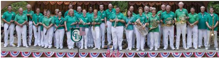
The Cary Town Band 27 th Annual Patriotic Celebration – A March for Patton July 3 rd Cary Arts Center 7:30 PM