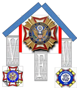
Cary VFW Thrift Store

The Cary VFW Thrift Store's Hours are Wednesday through Saturday from 10:00 am to 4:00 PM. There are always great deals and new merchandise every day.