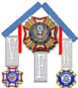
Cary VFW Thrift Store

The Cary VFW Thrift Store's Hours are Wednesday through Saturday from 10:00 am to 4:00 PM. And 10:00- 7:00 on Thursdays. Always great deals! Come on in, y'all!